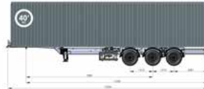
1 x 40' H.C.