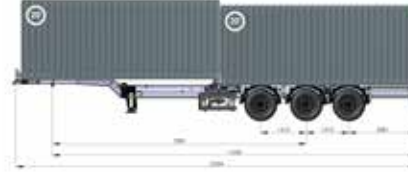
2 x 20'