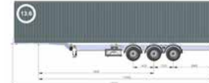
1 x 13.6 Euro / MegaCombi