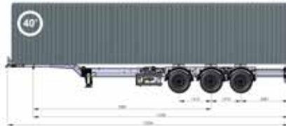
1 x 40' without tunnel