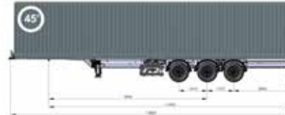
1 x 45' H.C without EuroCastings