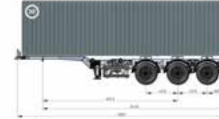
1 x 30'