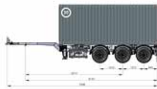
20' rear position