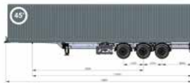
1 x 45' H.C