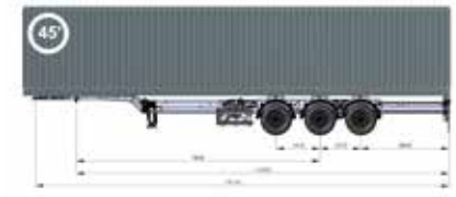
1 x 45' lifted