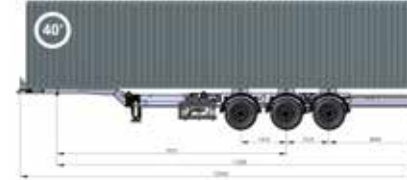
1 x 40' H.C. > 28 Tons