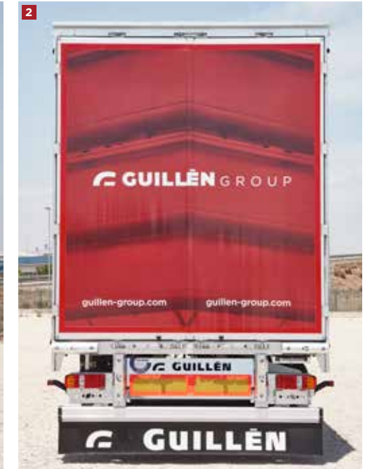
[1] Curtain Sider semitrailer [2] Curtain Sider semitrailer rear view