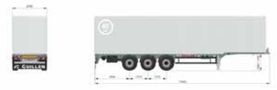
PC-40 HC X Light