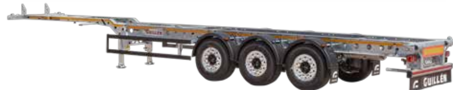
PC-45/40 HC X Light