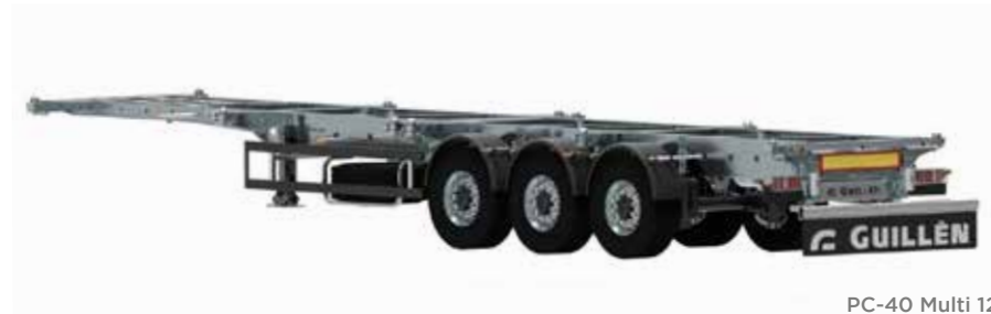
PC-40 Multi 12

*Under GDI, S.L.U surface treatments terms and conditions.