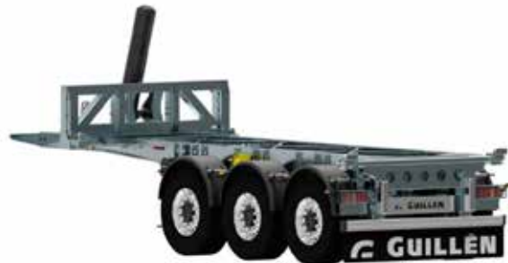
PC-20 3ES Tipper