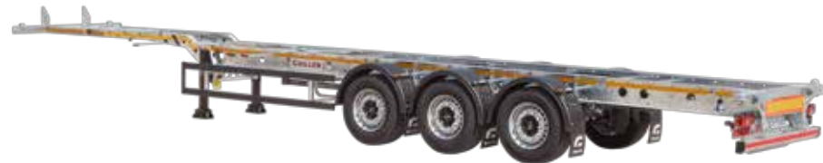
PC-45 HC X Light